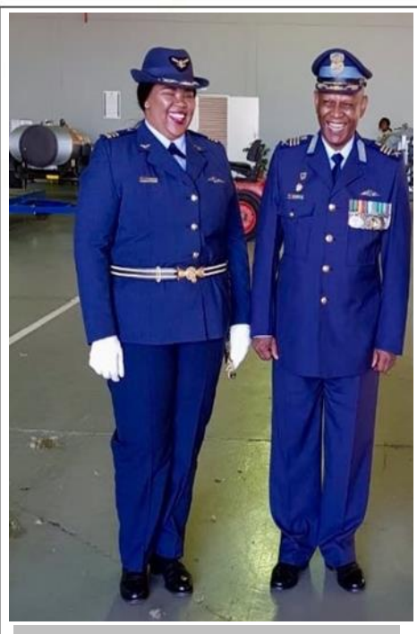
Phetogo is changing the SA Airforce-Bloemfontein Courant

Big-up's to our Female Fighter Pilots, one of the ways SANDF is blazing its own trail